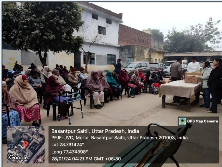
Basantpur Saitli, Uttar Pradesh, India PFJF+JVC, Morta, Basantpur Saitli, Uttar Pradesh 201003, India Lat 28.731424° Long 77.474398° 28/01/24 04:21 PM GMT +05:30