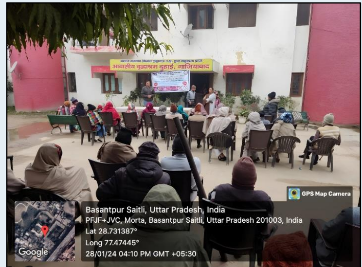
Basantpur Saitli, Uttar Pradesh, India PFJF+JVC, Morta, Basantpur Saitli, Uttar Pradesh 201003, India Lat 28.731387° Long 77.47445° 28/01/24 04:10 PM GMT +05:30