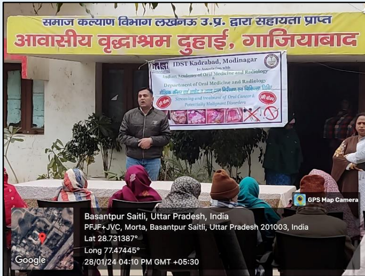
Basantpur Saitli, Uttar Pradesh, India PFJF+JVC, Morta, Basantpur Saitli, Uttar Pradesh 201003, India Lat 28.731387° Long 77.47445° 28/01/24 04:10 PM GMT +05:30