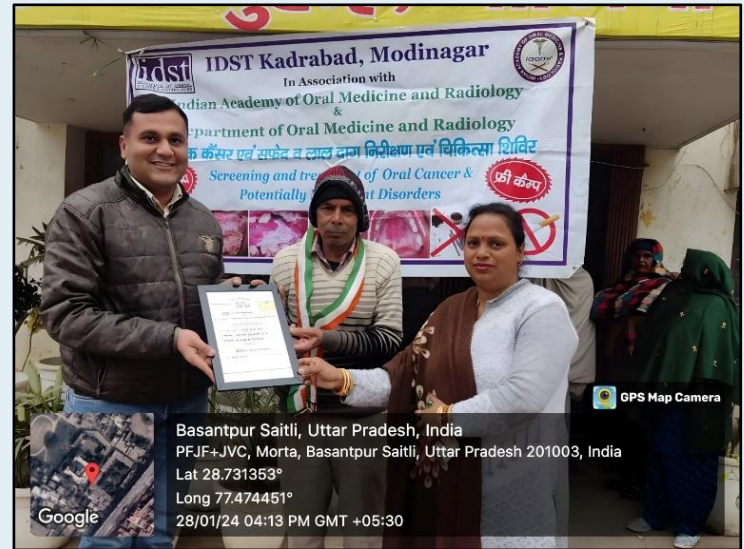
Basantpur Saitli, Uttar Pradesh, India PFJF+JVC, Morta, Basantpur Saitli, Uttar Pradesh 201003, India Lat 28.731353° Long 77.474451° 28/01/24 04:13 PM GMT +05:30