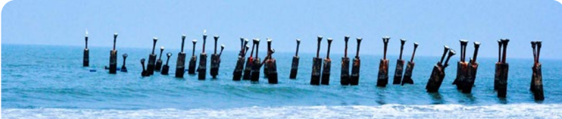
THE RUINS OF THE IRON BRIDGE OF THE BRITISH COLONIAL ERA