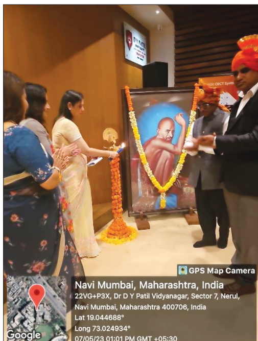
Inauguration with the Light Lamping

The first meet titled "Prathama" was convened at the auditorium of the prestigious D.Y. Patil Deemed to be University, School of Dentistry, Nerul, Navi Mumbai, on May 7th, 2023 marked the formation of the Maharashtra State Branch of the Indian Academy of Oral Medicine and Radiology (IAOMR) which was attended by around 100 delegates, including faculty, postgraduate students, and private practitioners from all over Maharashtra. The ceremonial induction of the Maharashtra State Branch, IAOMR commenced with the lighting of the lamp. The senior