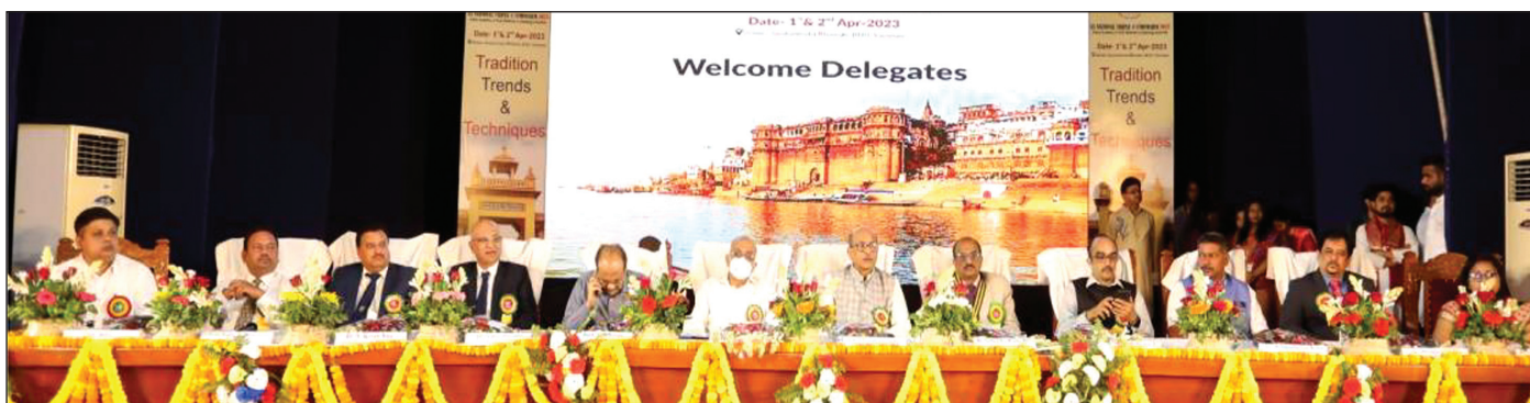
Inauguration Ceremony, Main Hall, Swatantrata Bhawan, BHU.

The National Triple 'O' Symposium was organized at Varanasi, the spiritual capital of India, and hosted by the Faculty of Dental Sciences, Institute of Medical Sciences, Banaras Hindu University on 01-04-2023 and 02-04-2023. The conference was organized under the aegis of the Indian Academy of Oral Medicine and Radiology (IAOMR) in collaboration with the Association of Oral and Maxillofacial Surgeons of India (AOMSI) and the Indian Association of Oral and Maxillofacial Pathologists (IAOMP).