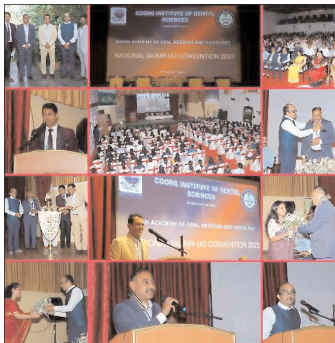
Inauguration of UG Convention

The second day too showed some marvelous scientific