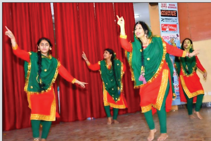
The Cultural Extravaganza