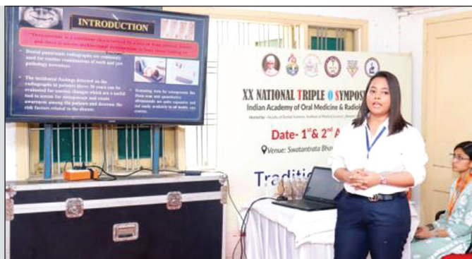
Presentation & Prize Distribution of Postgraduate Students

the field but also to share ideas for futuristic research in the concerned field.