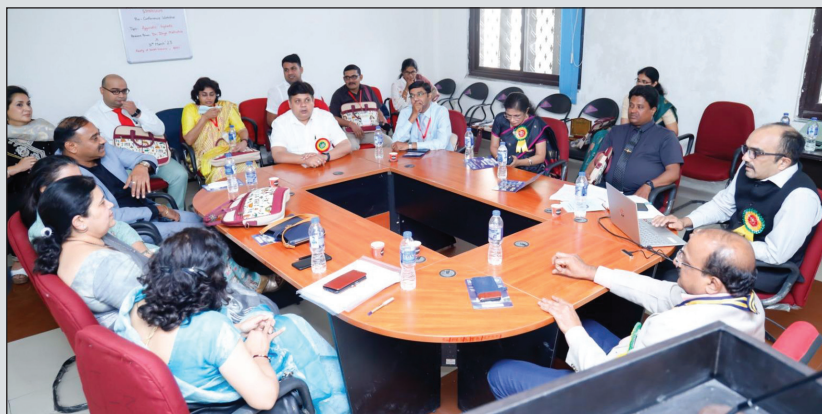
Meeting of the Executive Committee at FDS, BHU