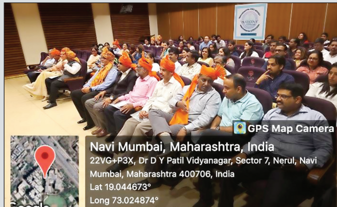
Faculty and Student Members of the Association Attending the Inaugural Event