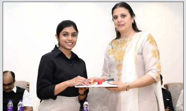
Presentation & Prize Distribution of Undergraduate Students