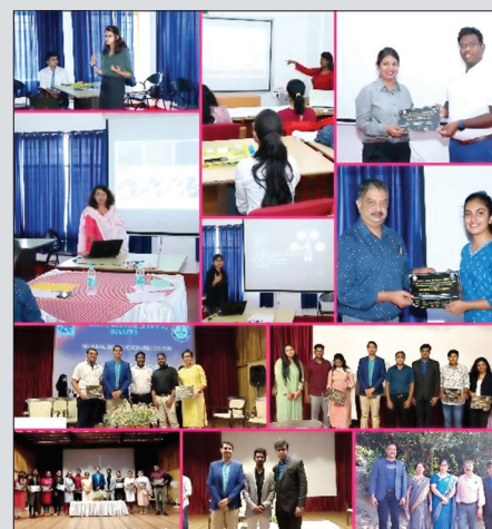
UG Student Presentations and Prize Distribution for Winners