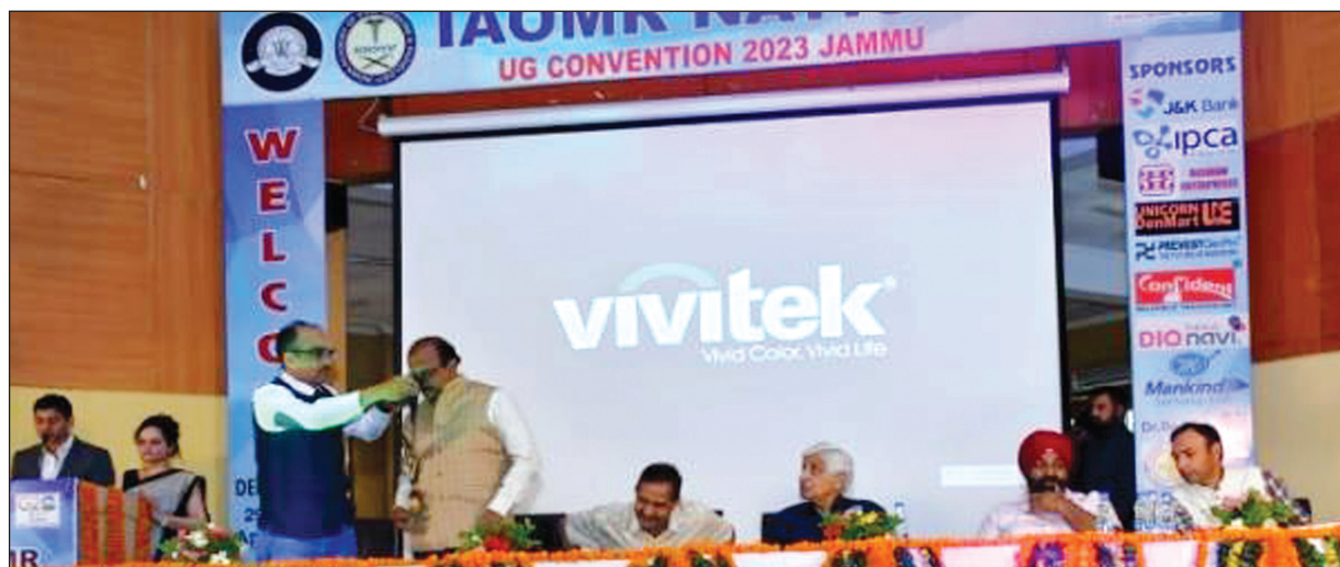
IAOMR Customary- Collaring The President by Hon'ble General Secretary

A two-day National level Undergraduate Convention was hosted by the Department of Oral Medicine and Radiology, Indira Gandhi government dental college and hospital Jammu in collaboration with the Indian Academy of Oral Medicine and Radiology (IAOMR) on April 29th and 30th, 2023.