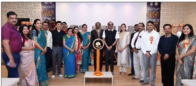
Inaugural Event Attended by all Dignitaries