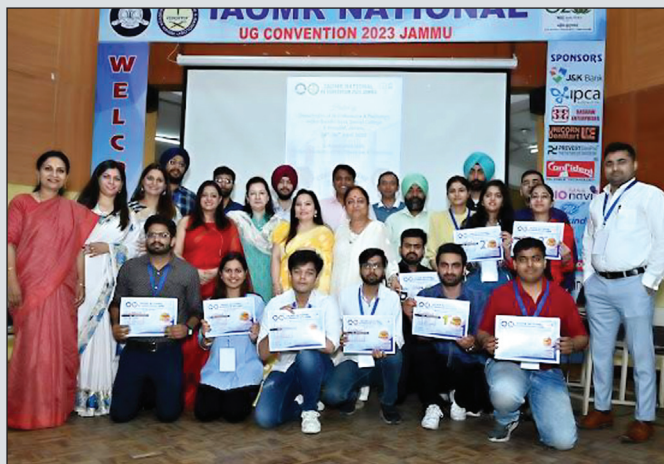
Winners of Quiz Event