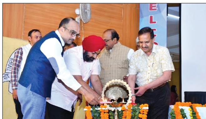
Lamp Lighting by The Dignitaries