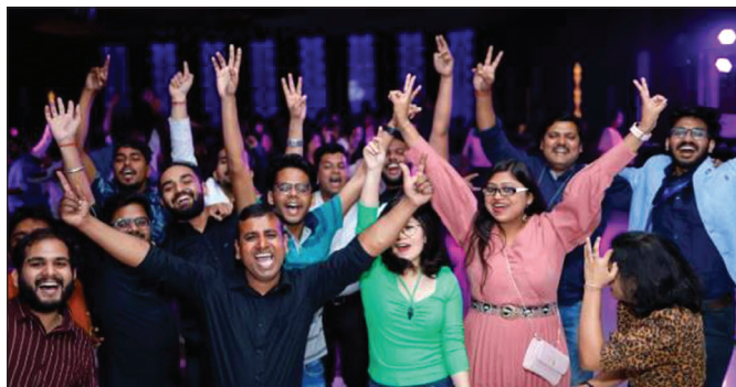
Gala Night, Triple 'O' Symposium, 2023

the field but also to share ideas for futuristic research in the concerned field.