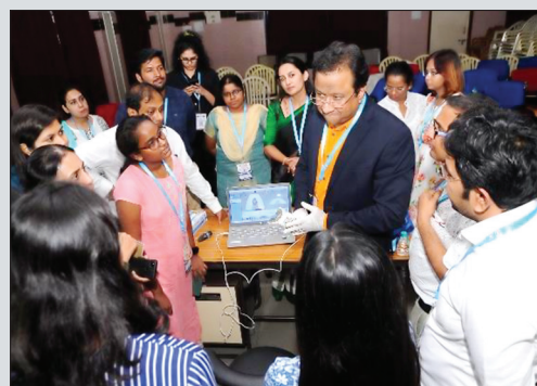
PRE-CONFERENCE COURSES IN 34TH NATIONAL CONFERENCE OF IAOMR