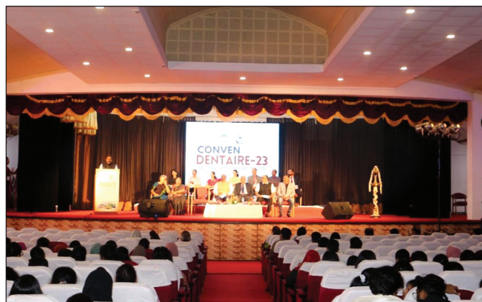
GUEST LECTURE IN UNDERGRADUATE CONVENTION

The Department of Oral Medicine and Radiology at MAHE Institute of Dental Sciences & Hospital, Chalakkara, MAHE, Puducherry, hosted a prestigious two-day National Level Undergraduate Convention on November 17th and 18th, 2023. The event was organized by the Association of Stomatologists and Maxillofacial Imageologists of Kerala (ASMIK) with the consent of the Indian Academy of Oral Medicine and Radiology (IAOMR).