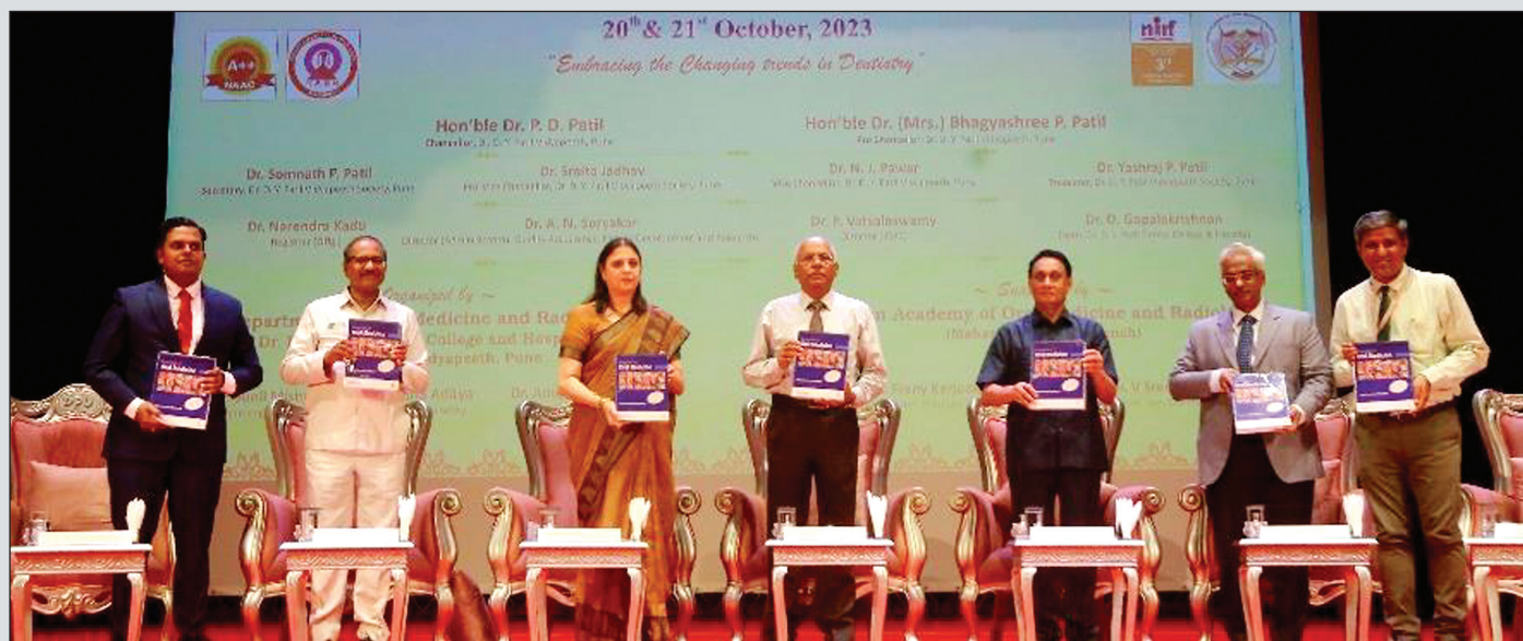
INAGURATION OF 1ST MAHARASHTRA STATE OMR UG CONFERENCE: PRARAMBH 2023

A two day State level Undergraduate conference was hosted by the Department of Oral Medicine and Radiology, Dr. D. Y. Patil Dental College and Hospital, Dr. D. Y. Patil Vidyapeeth, Pune in collaboration with the Indian Academy of Oral Medicine and Radiology, Maharashtra State Branch (IAOMR-MSB) on 20th & 21st October 2023.