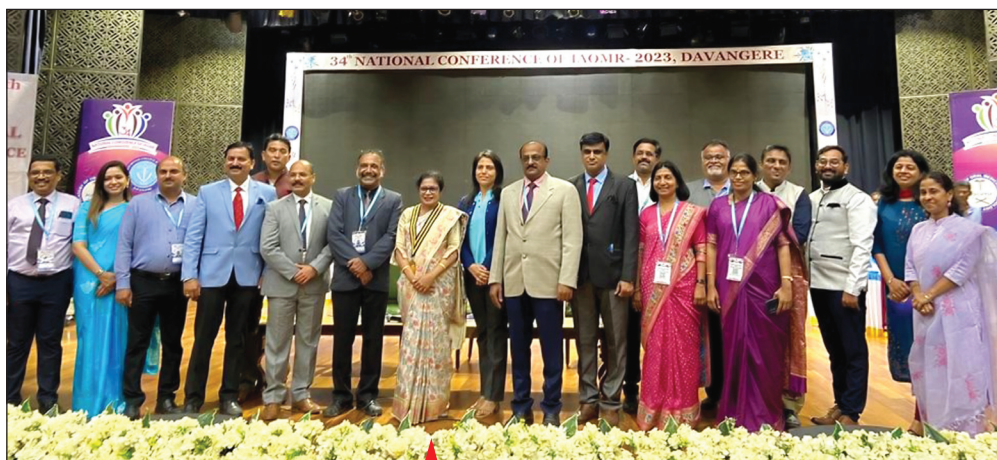
GLIMPSE OF ANNUAL GENERAL BODY MEETING HELD ON 02-12-2023