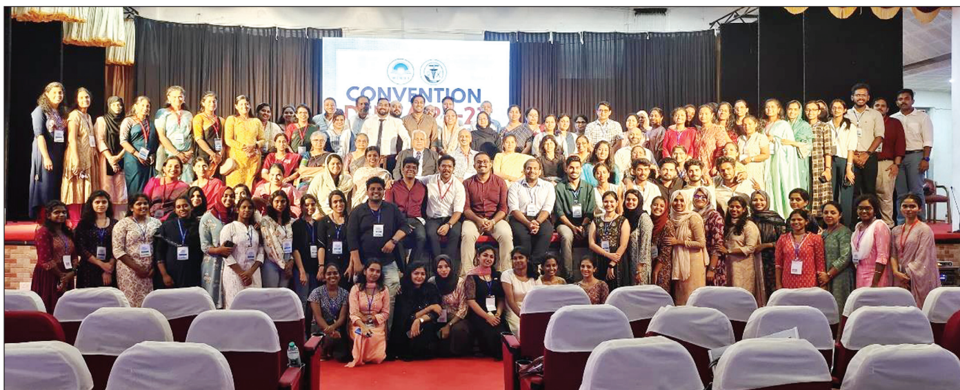
STUDENTS PARTICIPANTS WITH STAFF DELEGATES