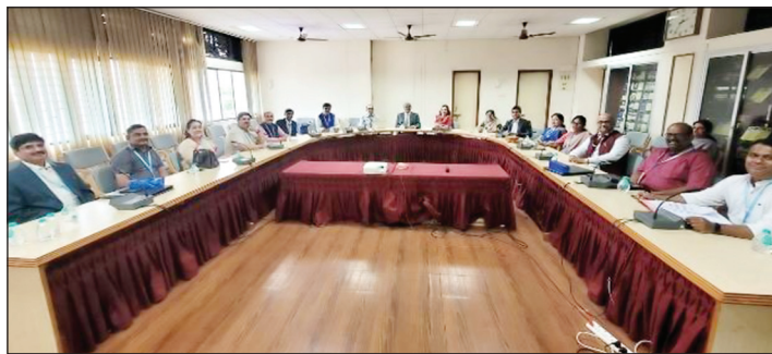
FOURTH EC MEETING HELD ON 01-12-2023