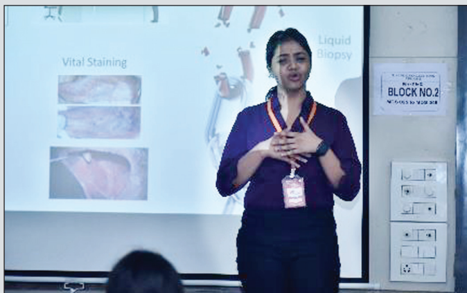
UNDER GRADUATE STUDENT'S PRESENTATIONS