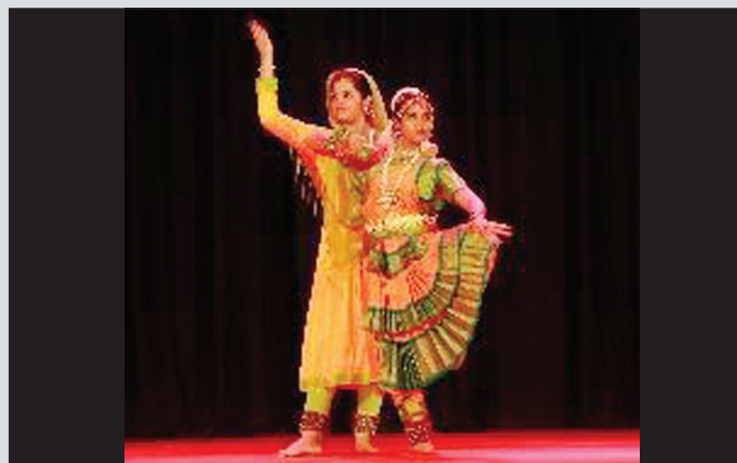
UNDER GRADUATE STUDENT'S CULTURAL ACTIVITIES