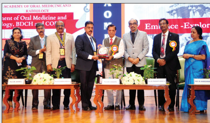
INAUGURATION OF THE 34TH NATIONAL CONFERENCE OF IAOMR