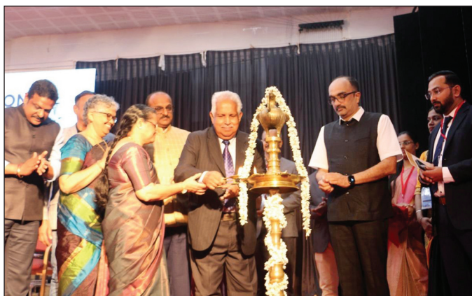
INAUGURATION OF NATIONAL UNDERGRADUATE CONVENTION, MAHE